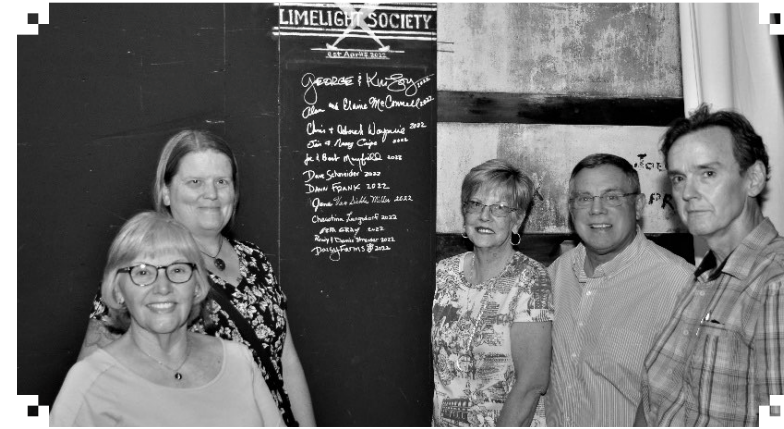
New Limelight Society Members add their names to the Opera House backstage wall

We are planning to host one Legacy event a year and have been generating ideas for future events such as a weekend showcasing musicians originally from Carroll County. If you have ideas for future honorees, go to the DPS website and fill out the short survey linked from the homepage.