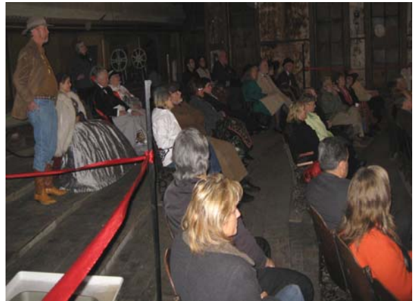
After dinner, the Halloween party goes assembled in the Opera House for a showing of the Lon Chaney silent film classic, The Phantom of the Opera .