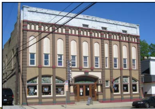
Owned by Times Past Restorations, LLC. Photo 2009.

In 1892, George Stengel rented the space to convert it to a sanitarium and public bath house. There had been drilling in the area for natural gas wells, and water with "medical qualities" was found. Stengel also piped in water from Snyder's Spring and from a spring in South Delphi. There was enough gas from the well to heat the water for the 12 baths. The waters were believed to treat "neuralgia, rheumatism, indigestion, and blood diseases."