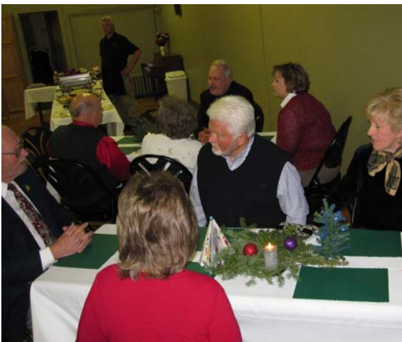
Delphi Preservation Society members and friends join together in the Art Gallery for dinner and good times at the DPS Christmas party. It was a good end to a good year.