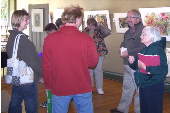
People gather at the Art Gallery for hot chocolate in preparation for the historic homes walking tour.