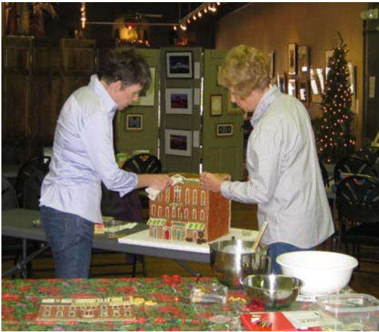
Volunteers work on the DPS entry in Delphi Main Street Association's first annual "Gingerbread Walk."