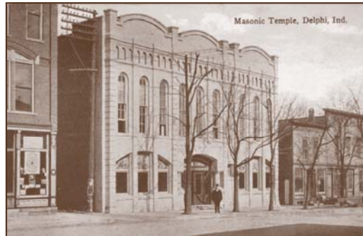
Postcard of Masonic Temple, after 1913.

The parapet on the façade above the roof has changed at least twice since its original construction. It was straight across the top, but later was enhanced by arches. The brick surface was parged with a cement mixture. The