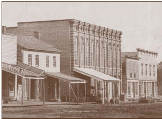
Occidental Hotel, 1875.