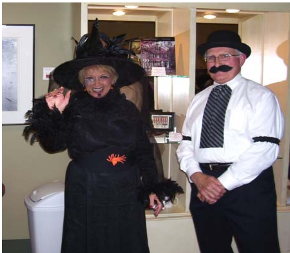
The Traegers dress up for the Halloween party at the Art Gallery. A catered dinner was later served.