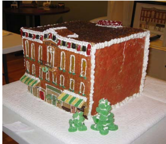
A replica of the Delphi City Hall was DPS's winning entry, winning the Group, Historic, and Peoples Choice Awards.