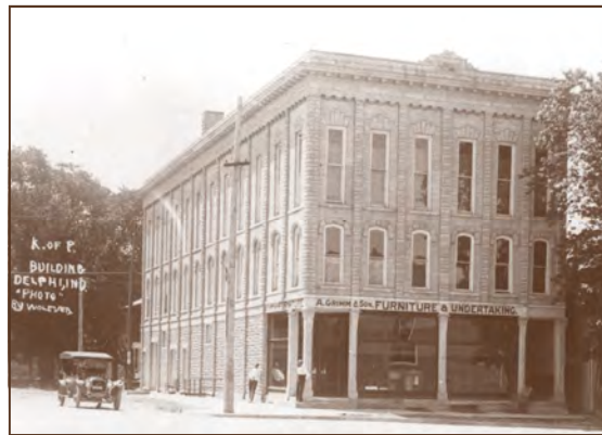
K of P building with Grimm and Son's Furniture Undertaking.

It later housed a Kroger store for many years and Kelly's Cardinal grocery. A part was used for the Carroll County License Branch. The upper floors were the Sieber Apartments.