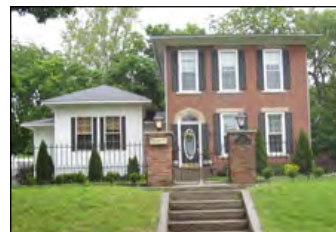
The Parks-Bankman house at 203 E. North Street won the DPS Recognition Award for Historic Residence Pre-1920 . The Italianate brick was built in the 1860s. The present owner, was not able to attend.