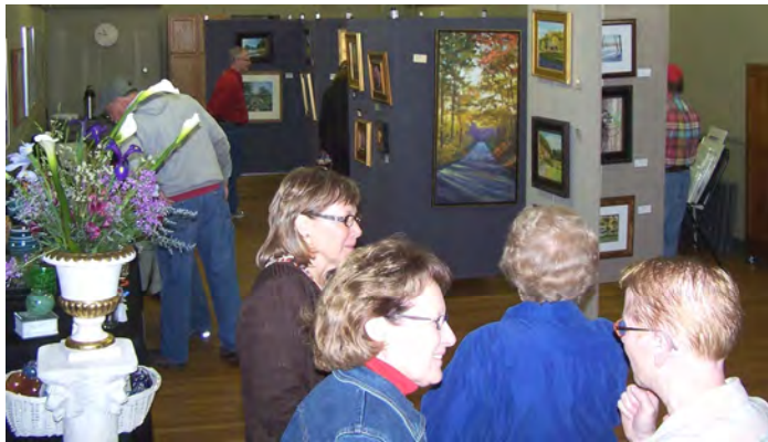
When the weather did not cooperate, the Carroll County Arts Council’s first annual “Celebrate the Arts” festival needed a place for artists out of the wind and rain. The DPS Opera House Gallery of Contemporary Art offered its available space as did exhibitors in the Courthouse. The Festival was a success.

Delphi’s Courthouse Square Historic District is now on both State and National Registers of Historic Places... recognizing more than 42 properties in Delphi’s historic