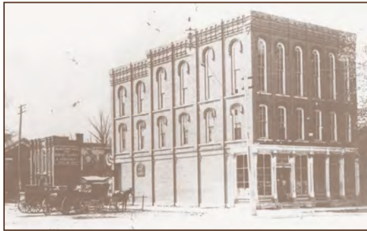
Lehnert building, early 1900s.

On the southwest corner of Main and Market streets is a three-story Italianate concrete-parged brick apartment and business building which has stood since 1869. "M. Lehnert Furniture" and "Battle Ax Plug"-- in faded paint--are still visible on the upper west side of the structure.