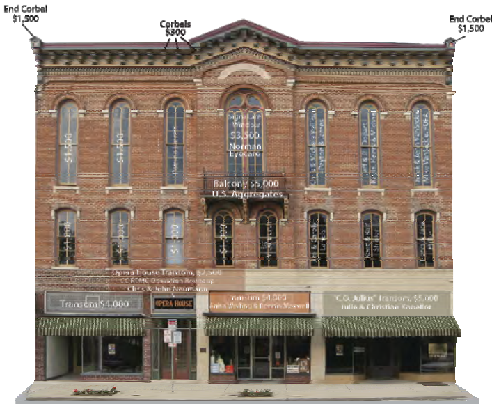
Restoration of the façade has been funded in part through a Historic Preservation Fund grant provided by the National Park Service administered through the Division of Historic Preservation & Archaeology of the Indiana Department of Natural Resources and by the City of Delphi through the Façade Improvement Program administered through the Delphi Main Street Association.