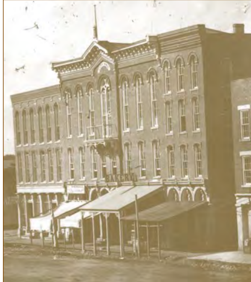
The Historic Crosby Hotel