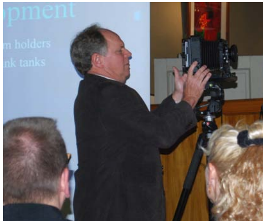
Photographer Alan McConnell describes the science of what takes place after the image has been captured.

The artists' reception that evening was well attended by workshop attendees and others. It was an excellent opportunity to get up close and personal with the three artists.