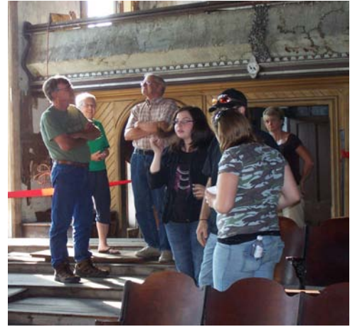
Visitors are treated to a tour of the Opera House on the third floor of City Hall.