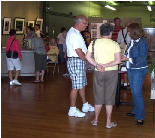
Old Settlers visitors cool off in the air conditioned Art Gallery, enjoying the art and talking to the artists.